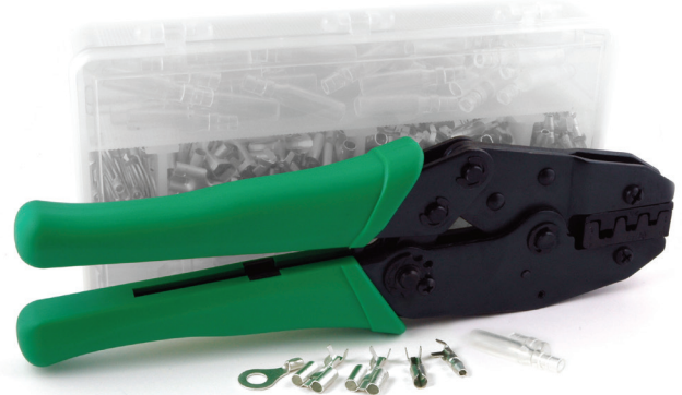
Use a Trail Tech Crimp Kit for a Professional Installation. P/N: HT230C

To wire two lights to turn on and off together, Y-crimp the wires together and hook them up as described above.