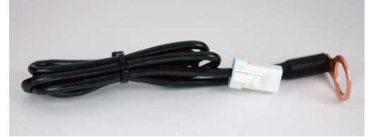
Head Temperature Sensor